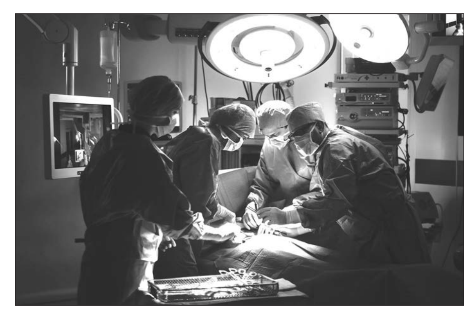
[An operation in the early 21st century]