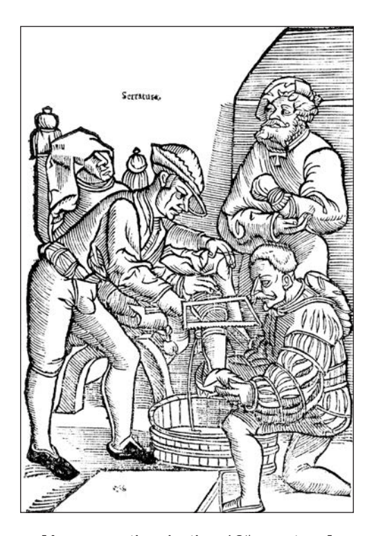
[An operation in the 16th century]